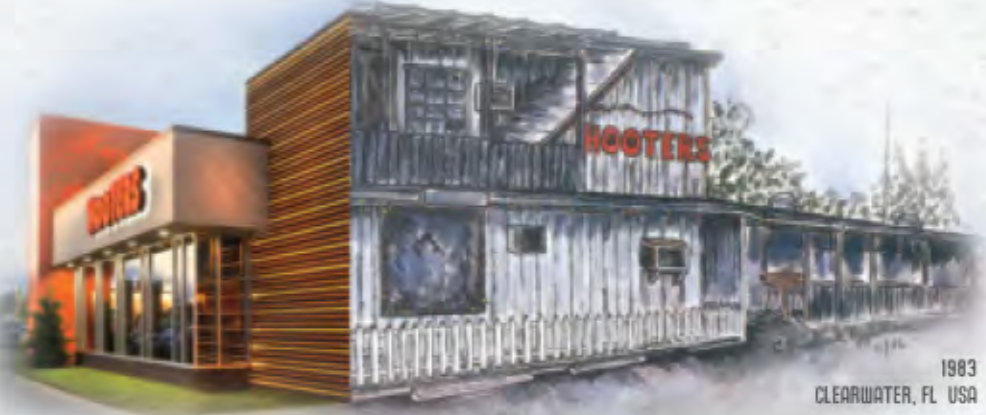
1983 CLEARWATER, FL USA