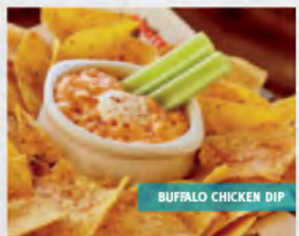
BUFFALO CHICKEN DIP