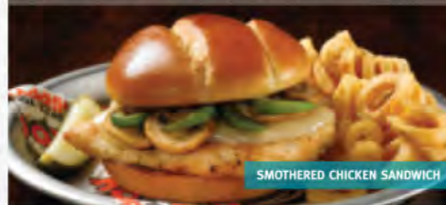
SMOTHERED CHICKEN SANDWICH

ALL SANDWICHES ARE SERVED WITH A SIDE OF CURLY FRIES. SUBSTITUTE FRIES WITH TATER TOTS, ONION RINGS OR A SIDE SALAD +.99