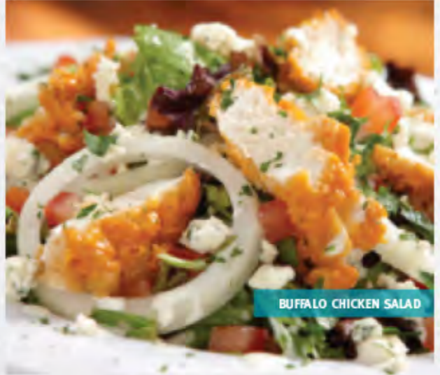
BUFFALO CHICKEN SALAD

SNOW CRAB LEGS Deadliest Catch™ approved! But seriously, you are about to bite into crab legs that are shipped to us from the frosty banks of Alaska and served up right with a side of butter. Makes you feel kinda fancy, doesn't it? 1 lb | MARKET PRICE