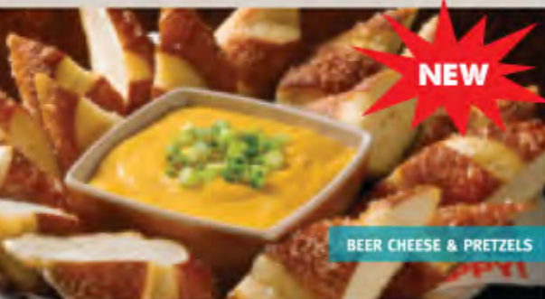
BEER CHEESE & PRETZELS