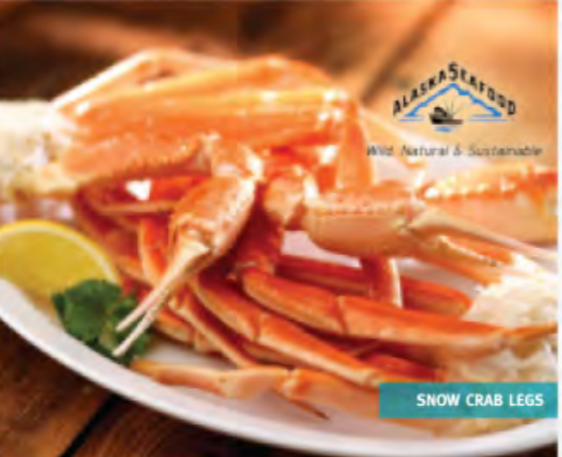
SNOW CRAB LEGS

CHICKEN GARDEN SALAD Spring mix greens piled with diced tomatoes, crisp cucumbers, cheddar cheese, Monterey Jack cheese and croutons and your choice of salad dressing. Topped with grilled or fried chicken. 9.99 Salad only, hold the chicken | 6.99