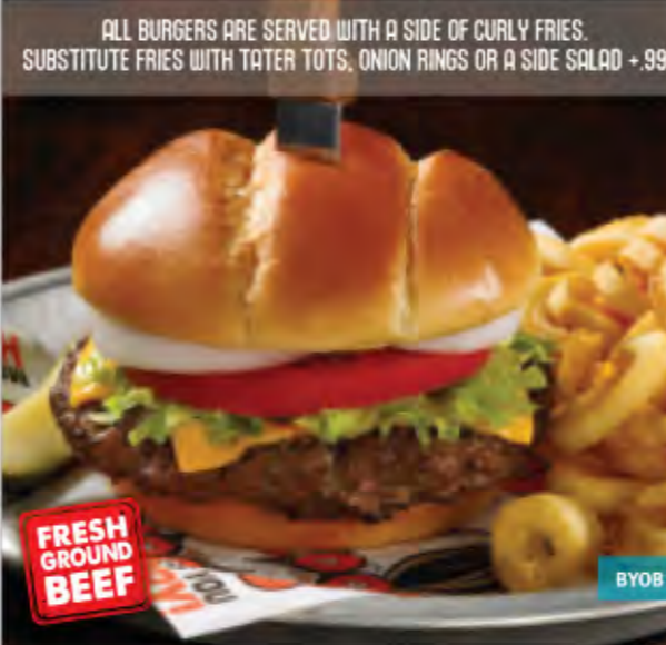
FRESH GROUND BEEF