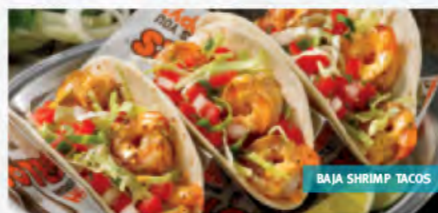
BAJA SHRIMP TACOS

Make it a Texas Cheesesteak with queso, Daytona Beach sauce, pico de gallo and sliced jalapeños +.99